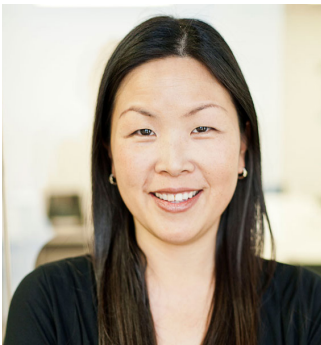
Soungun Young English Unlimited